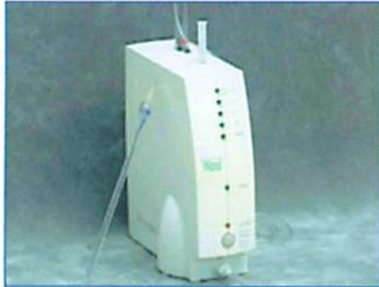
A computer injection system