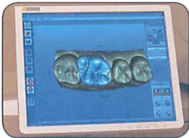
CAD/CAM computer image

Powerful computer-aided design and manufacturing technology, called CAD/CAM, allows us to custom fabricate tooth-colored restorations, crowns, onlays, and veneers right here in our office, and all in a single appointment.