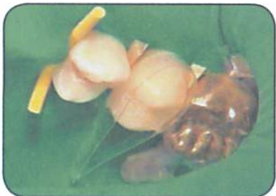
Milled restoration placed in mouth